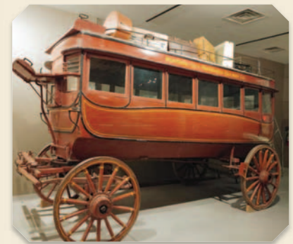
Horse-drawn tramway at the Canadian Railway Museum