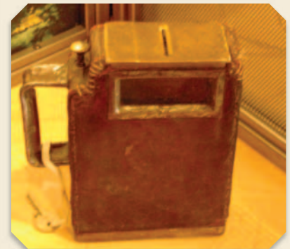
Collection box