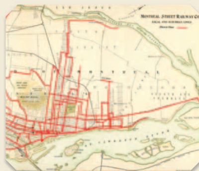
Plan of the Montreal tramways company network in 1914

Workers lived near their place of work. they travelled on foot, because the horse and later the automobile were unaffordable. Working-class neighborhoods were densely populated and highly urbanized. The tramway led to the accessibility of the suburbs of the time such as Plateau Mont-Royal, Rosemont, Ahuntsic, Villeray, etc. Far from noise and unsanitary conditions.