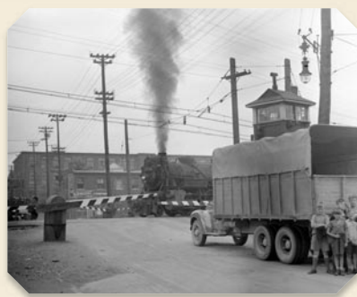
Scene in Saint-Henri in the middle of a working-class neighborhood in 1945

Electrification revolutionized the way people travelled. In the era of horses, the tram was little or not used by the working class, since it was too expensive (6 to 10 cents per passage). The electric tram was much more affordable.