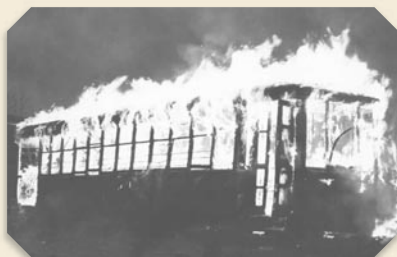
A tram destroyed by flames