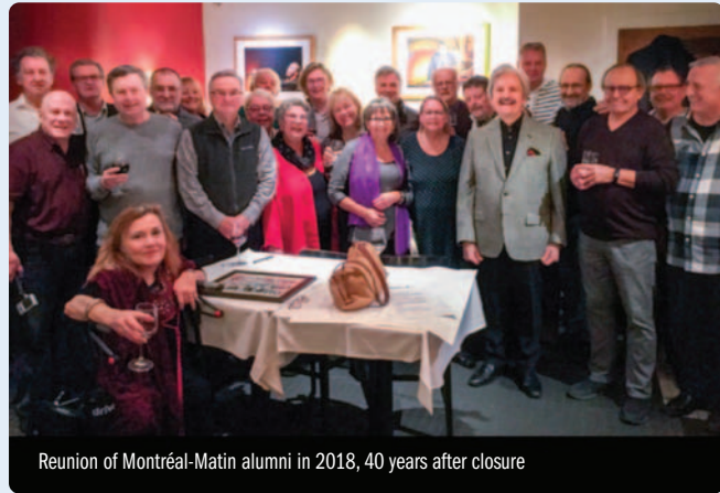
Reunion of Montréal-Matin alumni in 2018, 40 years after closure

If we then realize the passage of time and deplore the disappearance of some acquaintances, these encounters make us realize the happiness and the privilege we had in exercising a profession that we loved. Memories jostle through our minds and anecdotes follow one another, sometimes altered by memory or