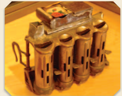
Device for money worn on the belt