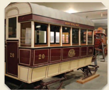
Winter horse-drawn tramway at the Canadian Railway Museum