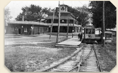
Bout-de-l'Île terminus near the Montreal Hunt Club in Pointe-aux-Trembles in 1921

The disappearance of the tramway is an eloquent example that Quebec is a North American society. Following the Second World War, transport infrastructure was devoted to the new queen, the automobile. In recent years, urban centres have been saturated in their capacity to accommodate the number of automobiles. They are questioning the quality of life and the place of the automobile in the city. Getting around differently is reminiscent of the debate raised by the establishment for a route reaching the summit of Mount Royal.