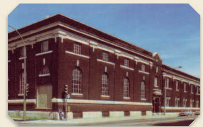
Maintenance workshop for trams (4505 Fullum Street)